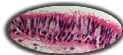
Normal human bronchiole