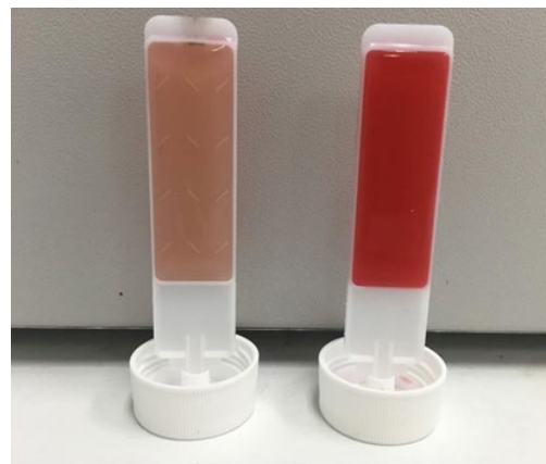
Figure 3. Representative dip-slide with double agar sides free of microorganisms. This dip-slide was used to test the XyliFos-containing dispersions after 48 h of environment exposure.