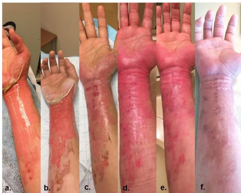
Figure 2 (a-f). Digital images of the patient's burn injury on the right arm: (a,b) 12h post-injury; (c) 7 days; (d) 10 days; (e) 14 days; and (f) 2 months post-injury.

Rx: PCCA Formula 12781 Naltrexone HCl 0.5% Aloe Vera 0.2% Base, PCCA Spira-Wash